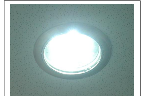
BINAY's 6-S/R PowerLED Downlighter is available in both round and square models, and in both cool white and warm white light emission

6S - 6-inch Square (or 'R' for round) R - Recessed (or 'S' for Surface Mount) 9 - 9 power LEDs 12W - Nominal Wattage CLR – Clear lens finish or FRD (frosted diffused) CW - Cool White (or 'WW' for Warm White)