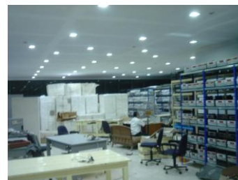
All factory illumination is with our 12W LED Downlighters. About 80 Downlighters have been used over a 5500 sq. feet area to achieve a lux level of 250 Lux on the work plane, as this is going to be an electronics factory.