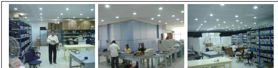
All factory illumination is with our 12W LED Downlighters. About 80 Downlighters have been used over a 5500 sq. feet area to achieve a lux level of 250 Lux on the work plane, as this is going to be an electronics factory.

With CFLs, the power consumption of the factory was projected to be 4.5KW. However, with our LED Downlighters, the total power consumption of the lighting is now only 1200W for an area of 5500 sq. feet, which translates to about 2 watts of power consumption per sq. meter only. With such low power consumption, this factory is now 100% lit by Solar power, making it India's first GREEN factory.