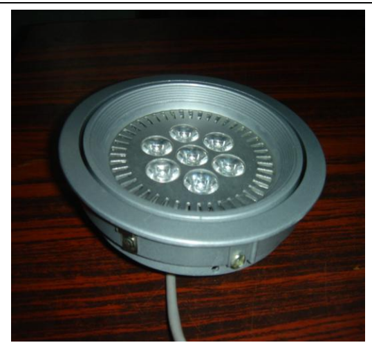
BINAY POWERLED QR111 MODULE