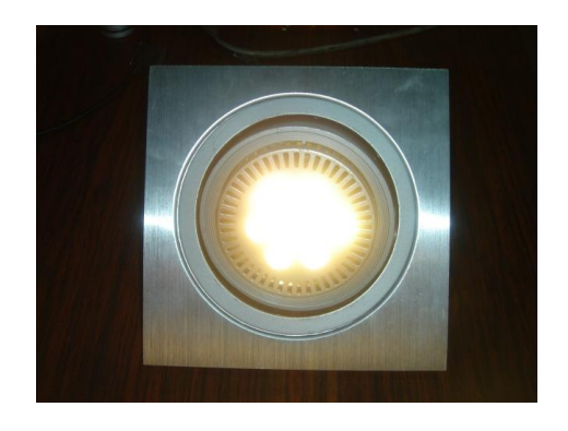
BINAY QR111 module mounted on faceplate (Faceplate supplied by user - not part of unit)