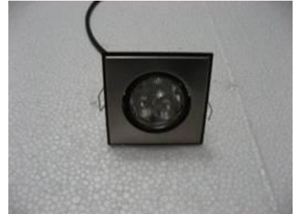
BINAY PowerLED MR-16 lights

Initially designed for the hotel industry, these PowerLED lights have the same colour, beam pattern and light output of standard halogen MR-16 lamps.