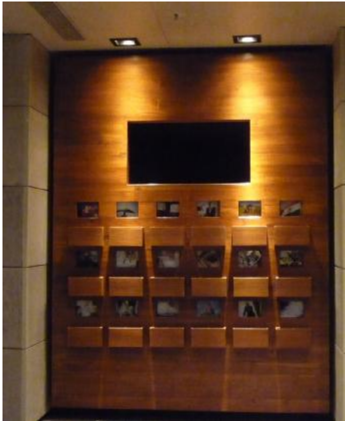
Entrance area Display Wall